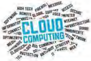
Five Challenges to Overcome in the Cloud